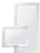
Casement & Awning Windows