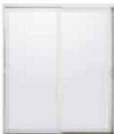
Gliding Patio Door